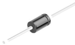
DO-41 Glass case COLOR BAND DENOTES CATHODE